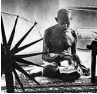
Mahatma Gandhi Foundation